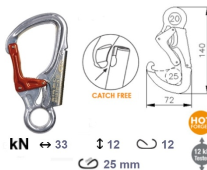
Fig. 3 Carabiner double action catch HAR025