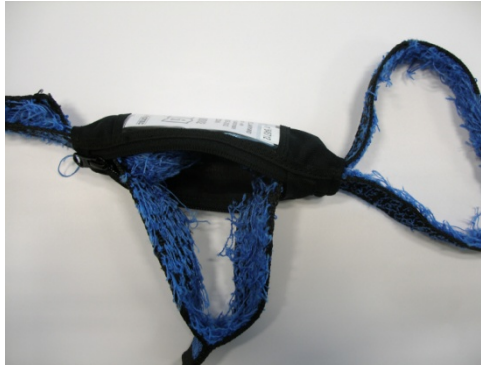
Fig. 4 Energy absorber having stopped a fall

If the lanyard has stopped a fall, the energy absorber is deployed and the lanyard must be discarded (Fig. 4).