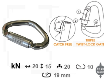
Fig. 1 Carabiner for sternal anchor point HAR015

Carabiners should be in accordance with EN362. Model of carabiners which can be attached to the lanyard are as follows.