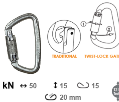
Fig. 2 Carabiner for back anchor point HAR013/018/024